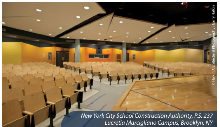
New York City School Construction Authority, P.S. 237 Lucretia Marcigliano Campus, Brooklyn, NY