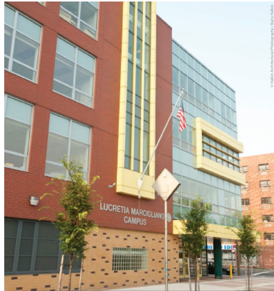
New York City School Construction Authority, P.S. 237, Lucretia Marcigliano Campus, Brooklyn, NY