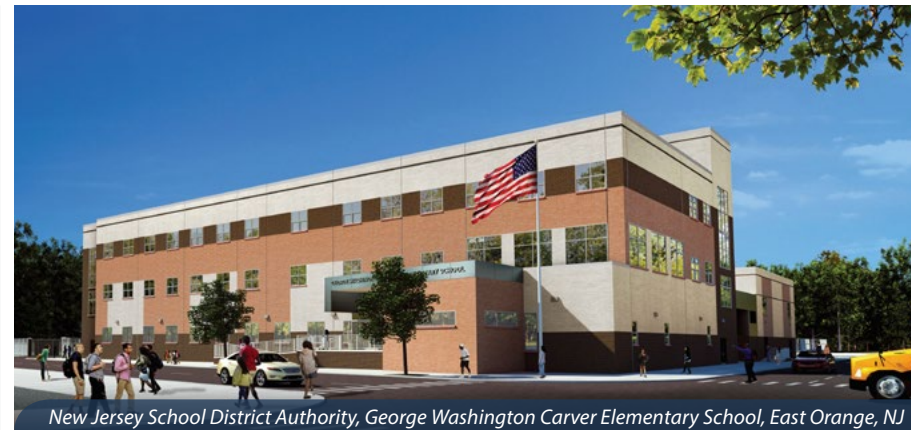
New Jersey School District Authority, George Washington Carver Elementary School, East Orange, NJ