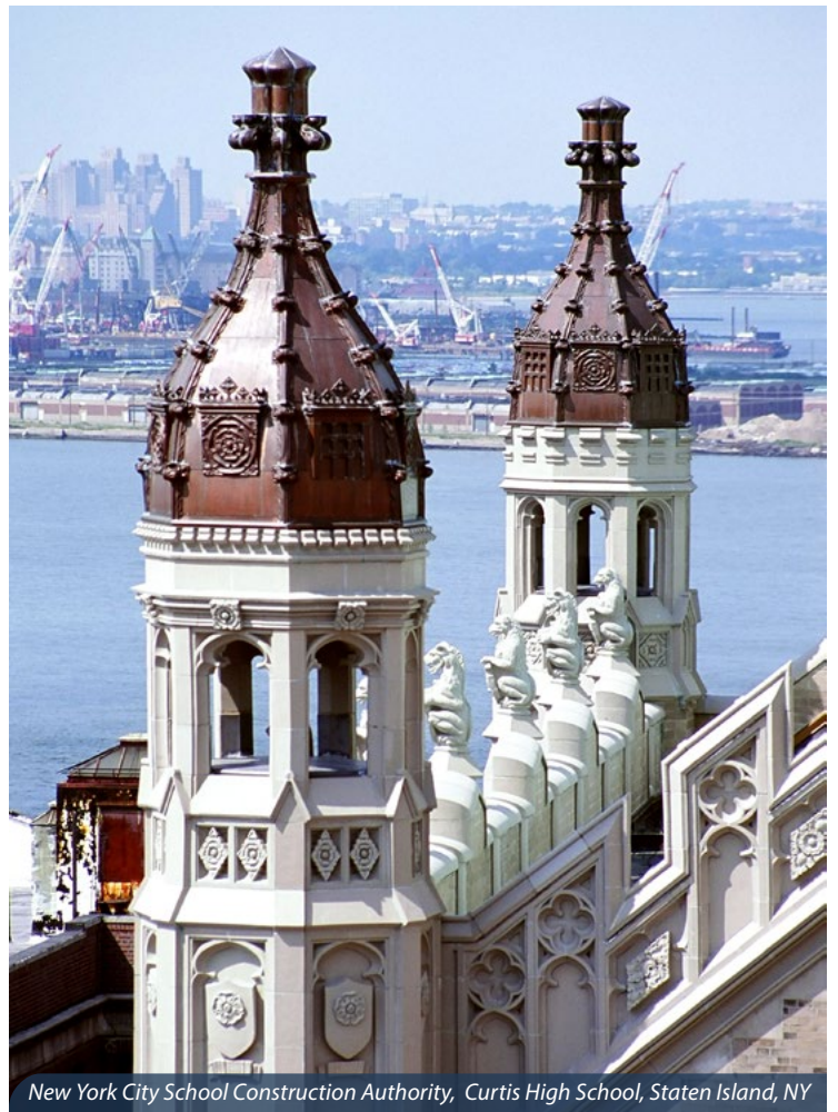
New York City School Construction Authority, Curtis High School, Staten Island, NY