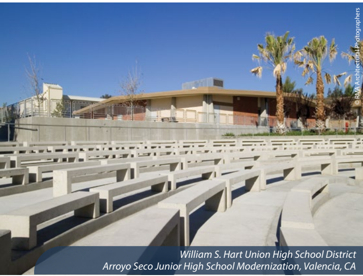
William S. Hart Union High School District Arroyo Seco Junior High School Modernization, Valencia, CA