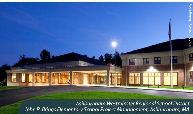
Ashburnham Westminster Regional School District John R. Briggs Elementary School Project Management, Ashburnham, MA