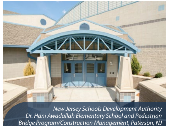
New Jersey Schools Development Authority Dr. Hani Awadallah Elementary School and Pedestrian Bridge Program/Construction Management, Paterson, NJ