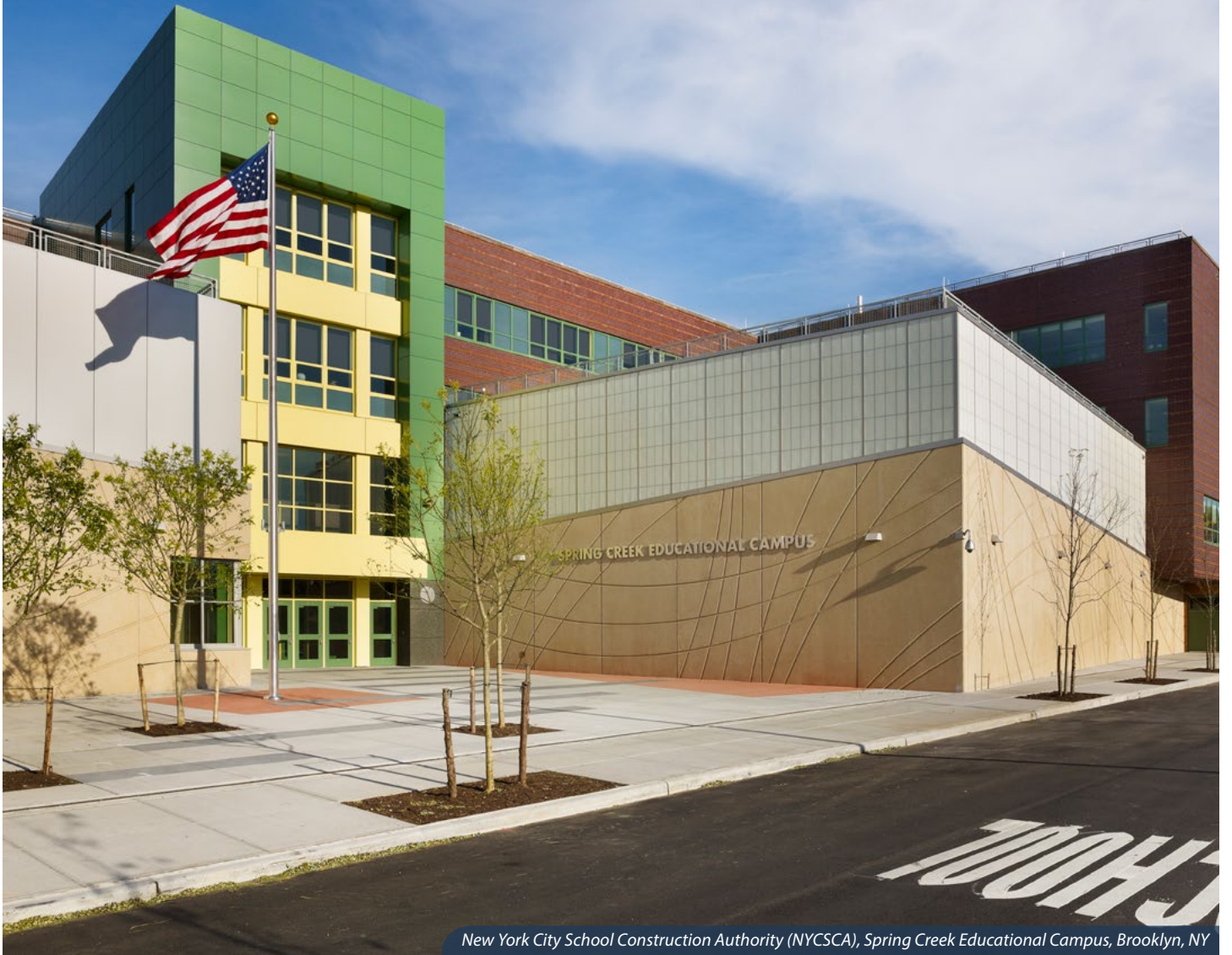
New York City School Construction Authority (NYSCA), Spring Creek Educational Campus, Brooklyn, NY