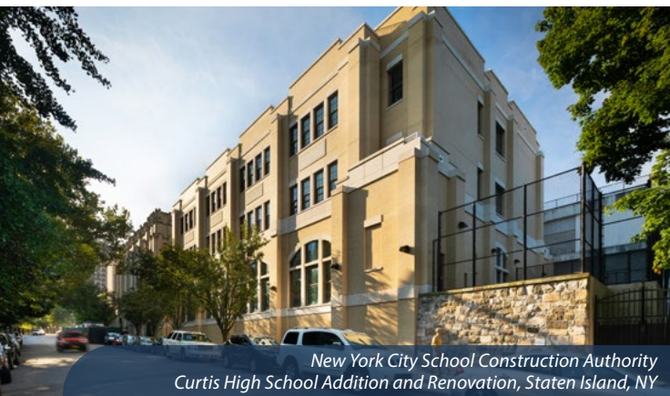
New York City School Construction Authority Curtis High School Addition and Renovation, Staten Island, NY